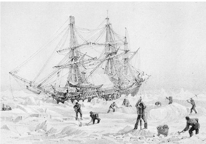
HMS Terror stuck in the Arctic ice