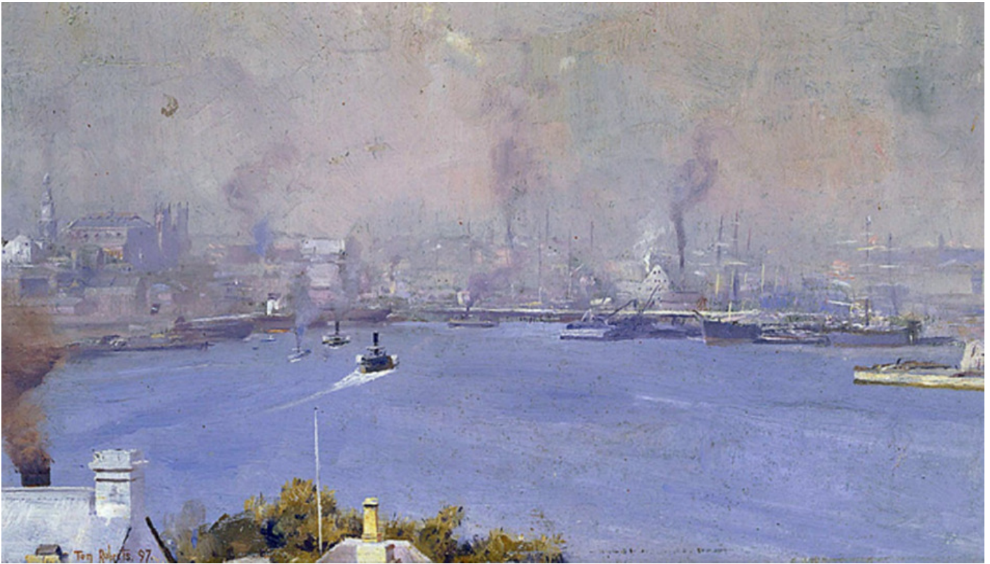
Sydney Harbour from Milsons Point, by Tom Roberts 1897